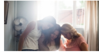
A Fierce Prayer for Healing