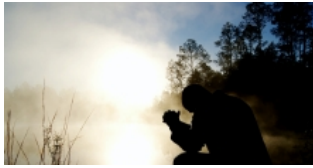
The Voyage Home: A Prayer for Re-Entry after Rehab